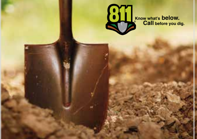
Join us in our commitment to safety.