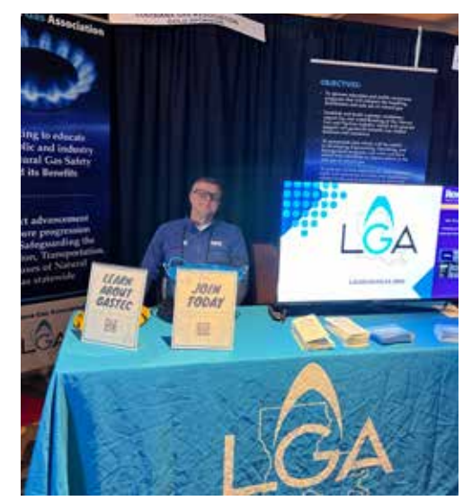
Louisiana Gas Association is an annual Gold Sponsor.