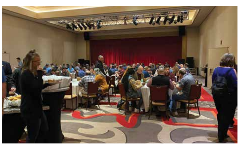
Enjoying good food with good friends.