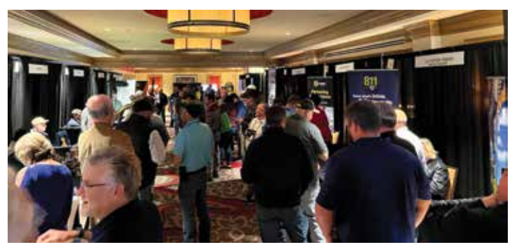
The Exhibit Hall was jumping throughout the event.