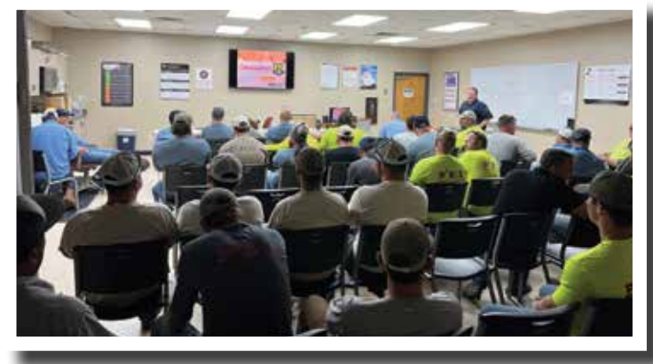
CLECO and Preferred Electric breakfast safety presentation in Mandeville.