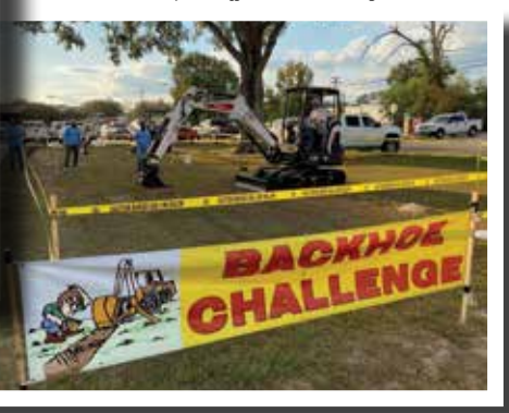
Backhoe challenge at Baton Rouge.