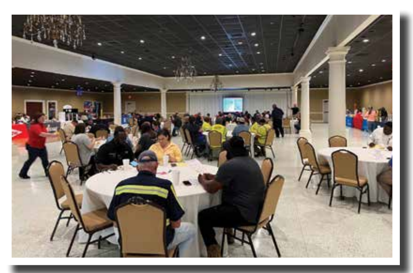
Pipeline Association of Louisiana (PAL) meeting.