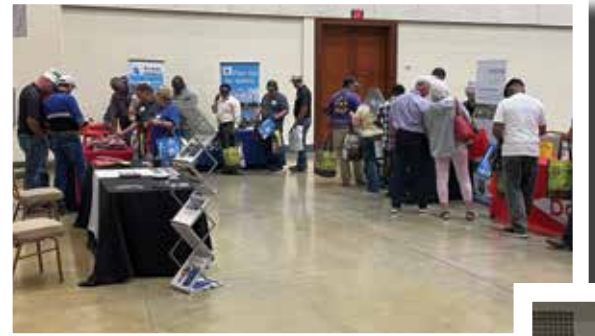
Lake Charles Utility Coordinating Council