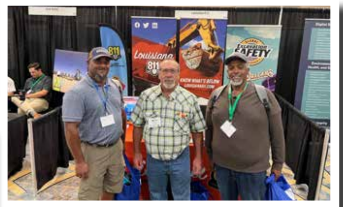
LGA Pipeline Safety Conference 2023.